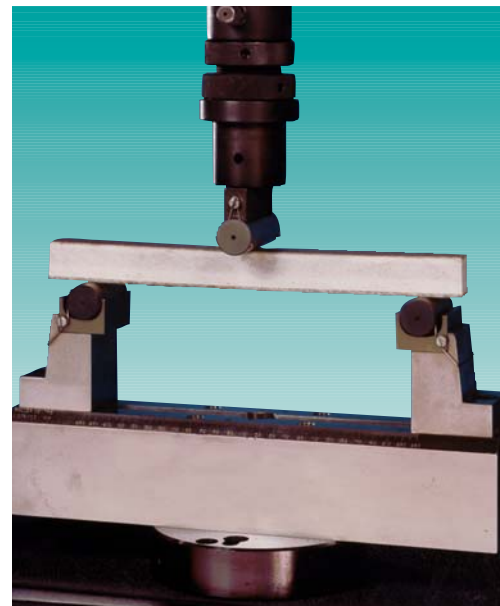
▲ Three-point flexure fixture - three-point loading