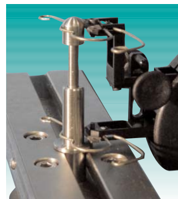
▲ Deflectometer using clip on extensometer