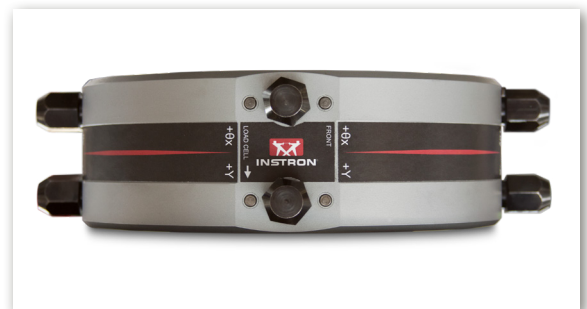
AlignPRO Alignment Fixture