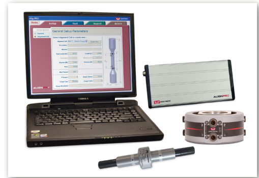
AlignPRO Alignment system

Custom alignment cell definitions can be created and stored in a local specimen database. The software also features a comprehensive reporting tool.